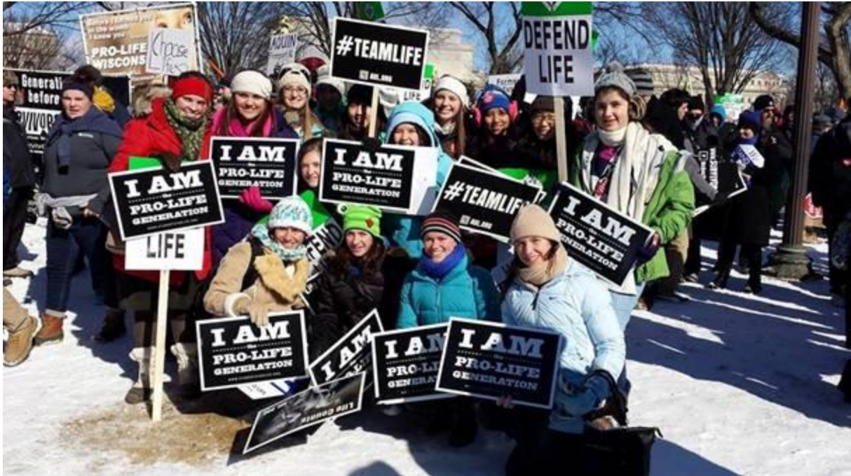
Students in the Immaculate Conception Program, and their consecrated chaperones, at the March for Life.

the infamous Roe versus Wade decision. Thank you students for your amazing witness!"