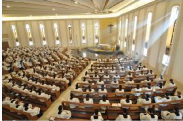
Professions Mass